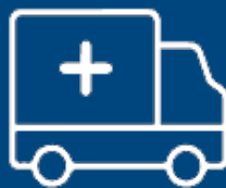
RxP central-fill pharmacy fills and ships prescription back to AMP Clinic weekly