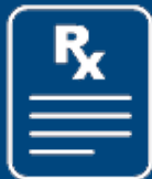
AMP Clinic writes prescription and sends to RxP central-fill pharmacy