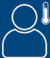
Patient is seen at AMP Clinic

By providing access to 56 of the most needed generics, Rx Partnership can help reduce facilities' overall spend on medication, increase prescription pick-up rate for patients, and ultimately improve health outcomes for a population that cannot afford the rising cost for generics.