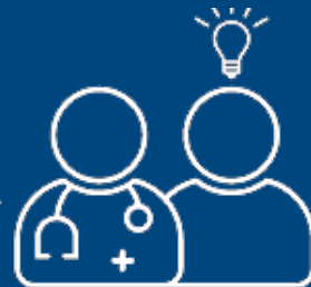
AMP Clinic provides medication education along with prescription to patient